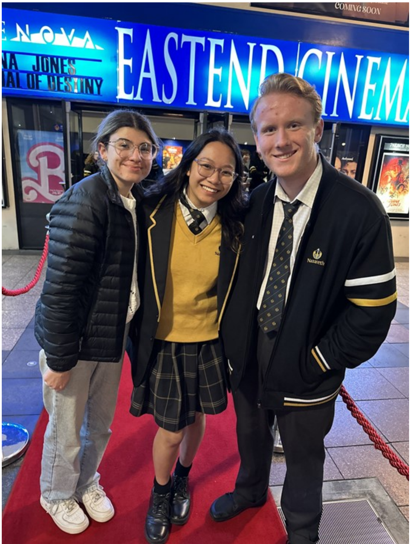
The red carpet was rolled out for us last night as short films from the Stage 2 Media Studies class were shown to family and friends on Adelaide's biggest cinema screen Palace Nova.