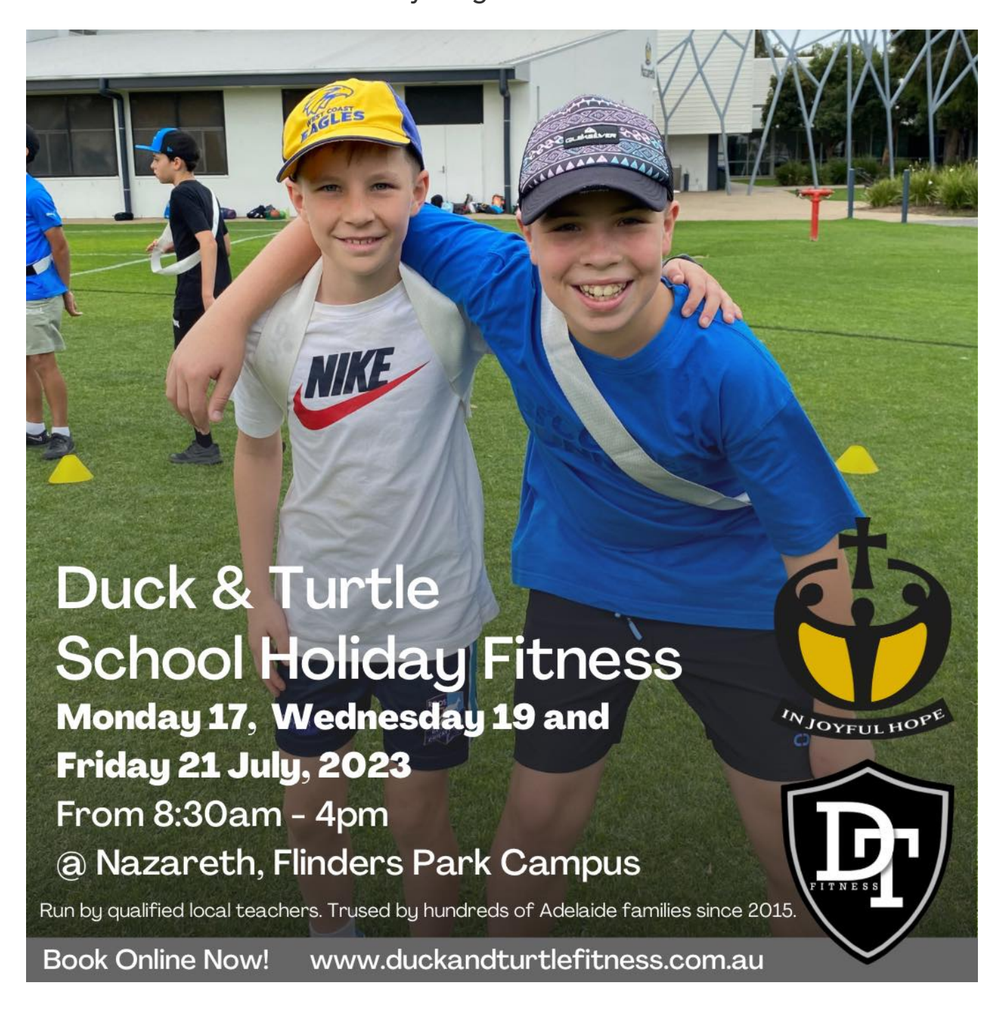
Years 4-7 | Duck & Turtle Holiday Programs